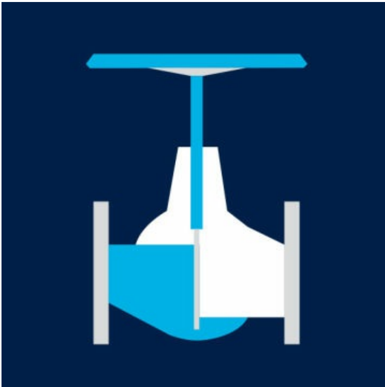
Knife gate valves